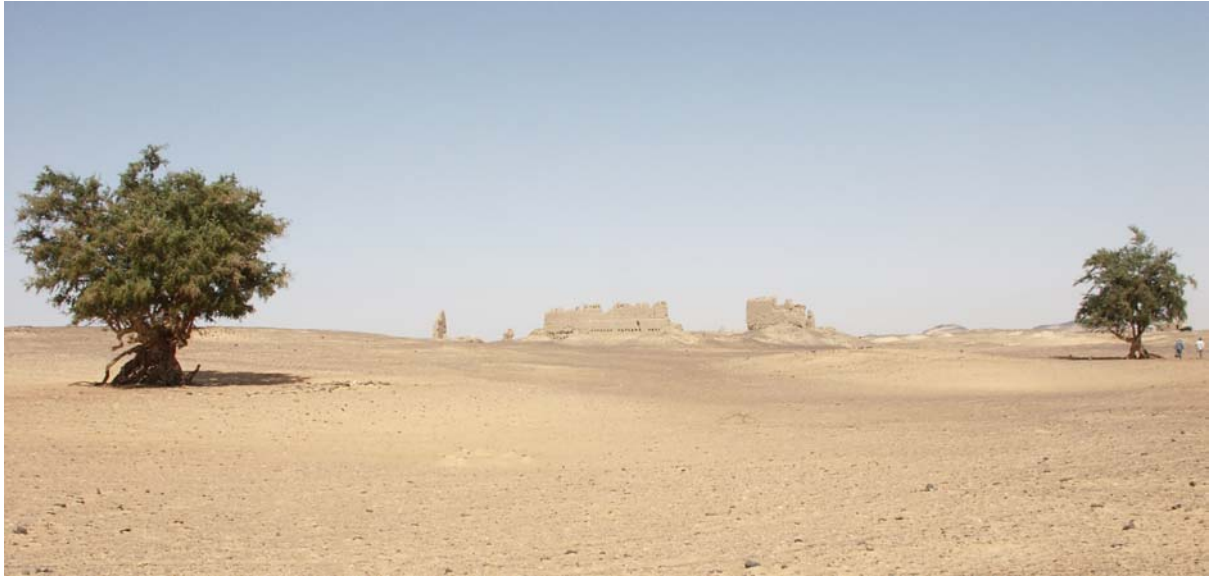
Fig. 5: El-Riz with its dominant, the fortress

by a Roman fortress, once briefly explored by A. Fakhri. Not far from the fortress lies an early Christian church. Near the fortress can also be seen the remnants of orchards (two obviously very old nabq trees).