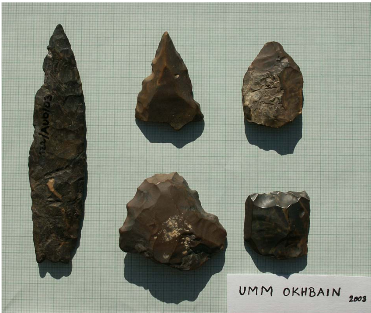
Fig. 2: Finds from the Umm el-Okhbain playa