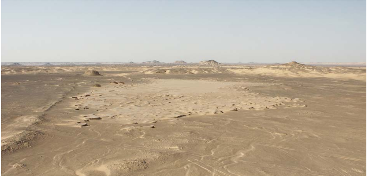
Fig. 1: Umm el-Okhbain playa