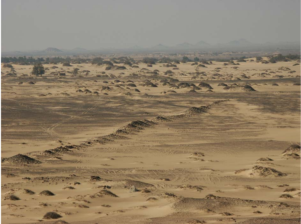
Fig. 3: Bir el-Showish, one system of manawars documented during the survey