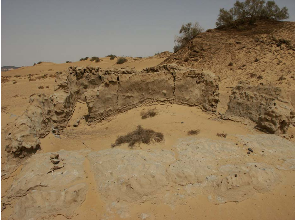
Fig. 4: Tabla Amun, one of the house structures preserved on the site